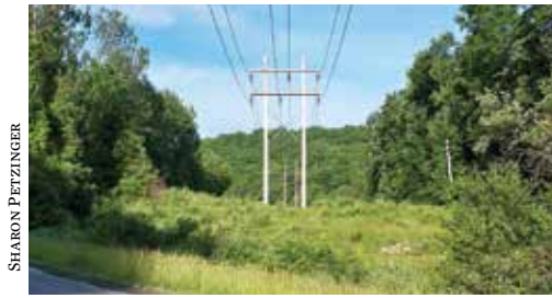
Figure 3. ROW with minimum shrub cover for Golden-winged Warbler.