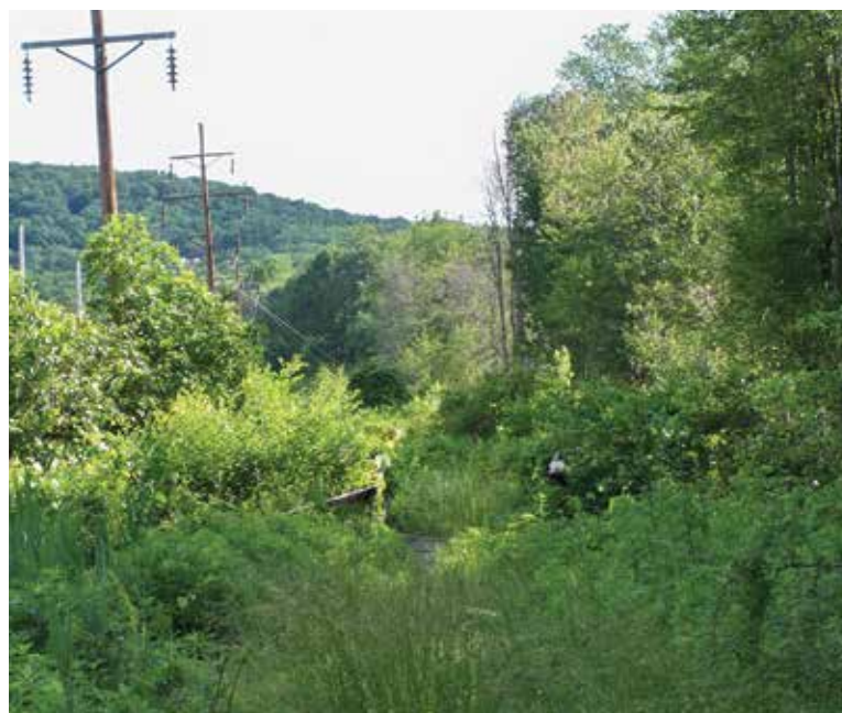
Figure 2. Narrow ROW adjacent to early successional habitat.