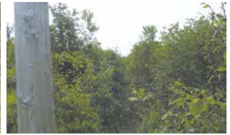
Figure 4. ROW with maximum shrub cover for Golden-winged Warbler.