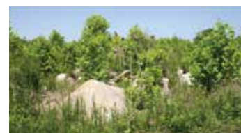
Figures 5 and 6. (Left) A site that has been ripped is ready for planting of native trees, shrubs, grasses, and forbs. (Right) A reforested site might grow into Golden-winged Warbler habitat within 4–5 years.