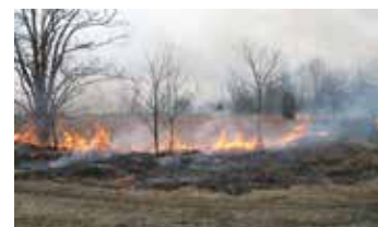
Figure 4. Prescribed burning on one Tennessee site has led to a five-fold increase in Golden-winged Warbler territories.