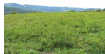
Figure 3. Pasture/hayland reclamation will not undergo succession for many years and will not be suitable unless there is management intervention.