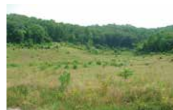
Figure 2. This site will be suitable within the next 2–5 years.