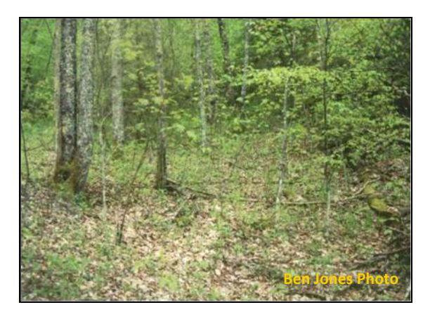
Mixed hardwood stands aged 40 years or older typically provide quality grouse nesting habitat.

Even-aged and two-aged forest management systems are ideal for creating secure drumming habitat. In most areas, availability of drumming logs is not a limiting factor. However, if whole tree chipping is prescribed, 1–2 trees per acre should be retained and felled for drumming logs after chipping operations. Gating forest roads and retiring skid trails with broad-leaf herbaceous plants will encourage male occupation within 125 yards of these linear habitats where males can drum in close proximity to spring foraging habitats (i.e., herbaceous growth along road margins).