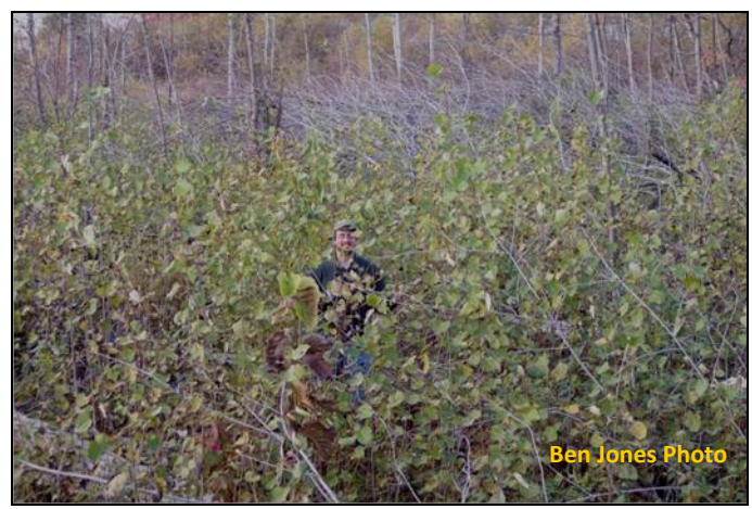
Harvested aspen stands regenerate with high stem densities favorable for grouse habitat.

In general, the greatest degree of overstory removal provides the greatest benefit to ruffed grouse. Clearcuts and two-aged stands provide excellent cover for ruffed grouse. Two-aged stands with <18 ft²/acre of basal area (10-20 trees/ac) can provide hard mast production in a young stand, open areas for foraging, shrubs and thick saplings for cover, and territories for a variety of declining songbirds. Grouse will use these stands in every season for escape cover, foraging, nesting, drumming, and brood rearing. In the mixed mesophytic and northern