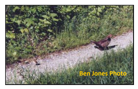
Forest roads dominated by perennial cool-season grasses, like this one planted with orchard grass, prevent chicks from escaping predators due to the dense vegetation structure. They also harbor fewer invertebrates compared to forb-dominated roads.

In maturing (>30 years), mixed hardwood stands with closed canopies, prescribed burning can create the diverse understory communities favored by grouse broods. Burning will kill some of the fire-sensitive trees creating small canopy gaps. This increased sunlight and available nutrients released from the humus layer stimulate herbaceous growth.