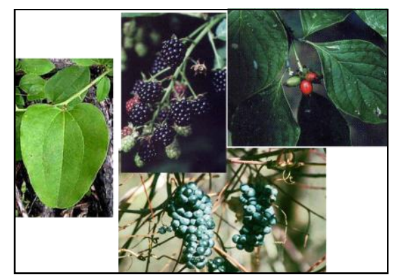
Pennsylvania grouse need diverse food resources throughout the seasons.

Stand Diversity. A grouse hen's reproductive potential is largely determined by her fitness during spring breeding season. Maintaining a diversity of food-bearing species in a stand while providing a diversity of age classes across the landscape should be a manager's over-arching goal when managing ruffed grouse. A study of 732 grouse crops collected in PA in January found items from 63 different plant species. This highlights the importance of "minor" stand components in grouse diets and in grouse habitat management. Stand diversity is