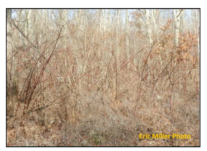
Excellent fall-winter habitat in a 10 year-old young forest stand.

class of young woody stems (5-20 years old) on the landscape at all times. Managers may also notice aspen saplings creeping into herbaceous openings. Ceasing to mow these areas will allow the clones to expand.