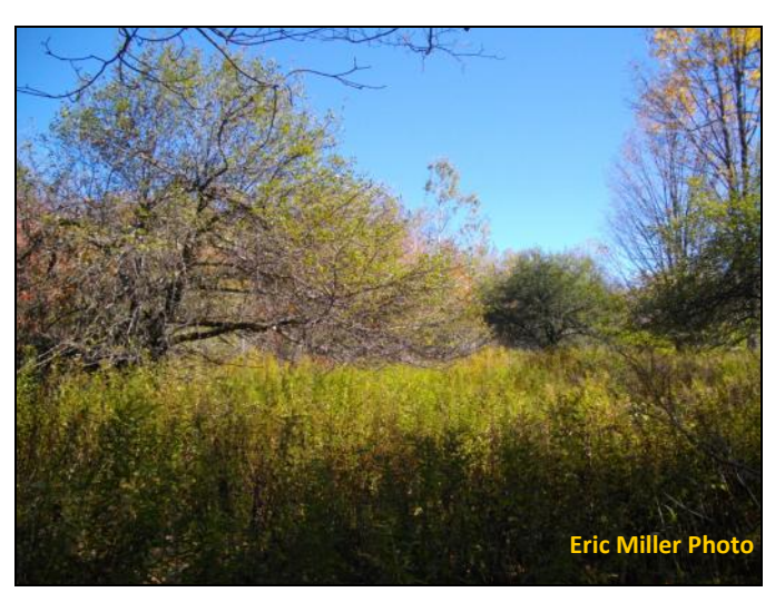
Old homesteads often contain good cover and fruit-producing trees.

Grapes. Grapevines should not only be retained, but promoted when possible. Grapevines are often found on moist sites, often in a narrow cove just above or below a forest road. These sites can be improved by thinning non-desirable trees and allowing sunlight into the site to stimulate additional groundcover and