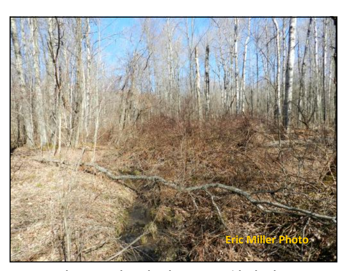
Seeps and seasonal wetlands can provide herbaceous foods and soft mast, even during winter.

Spring seeps. Even during periods of deep snow, these areas are often snow-free. Reducing canopy cover to approximately 50 percent around spring seeps allows increased light into the site and can promote herbaceous groundcover and shrub growth, which produces many fruits and seeds eaten by grouse in mid-winter.