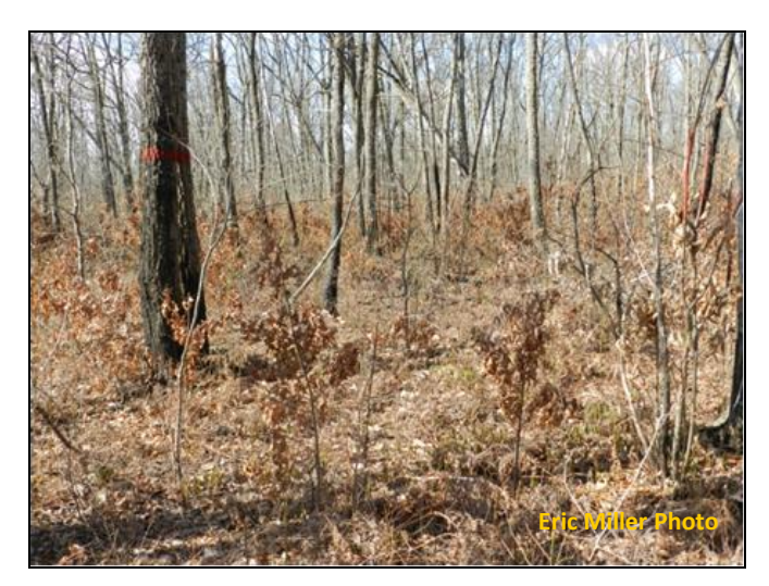
Two-aged stands provide multiple needs for grouse throughout the year.

In mixed oak forests, clearcutting without adequate oak regeneration will negatively impact the future oak component of the stand. Therefore, the intermediate treatment sequences outlined in oak silviculture guidelines (normally a shelterwood sequence with prescribed fire) is appropriate. With delayed harvest sequences such as shelterwoods, careful planning is especially important to ensure a young forest component remains on the landscape at all times.