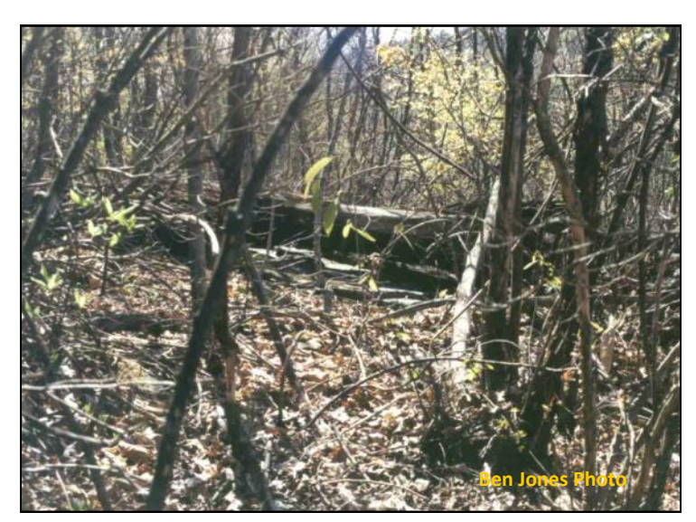
Drumming sites are characterized by a log or other platform surrounded by dense midstory cover of young trees and/or shrubs.

Male grouse occupy relatively small home ranges during the spring breeding season. These areas, often as small as 10-25 acres, are usually centered on several drumming sites. Commonly referred to as "drumming logs" these display platforms are about 12-18 inches high and surrounded by small diameter woody cover. Although logs are most often used, male grouse will use drumming stumps and large rocks. The keys to drumming habitat are availability of drumming platforms and dense mid-story stem cover. These conditions are most