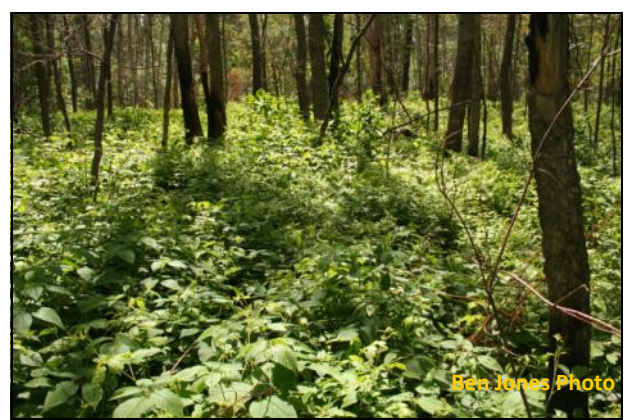
A closed canopy stand the summer following an April prescribed fire. Abundant herbaceous understory provides cover and invertebrates.

Herbaceous groundcover, invertebrates, and high midstory stem density (brambles, shrubs,