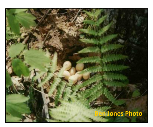
Grouse nests are often located at the base of a tree, stump, or log.