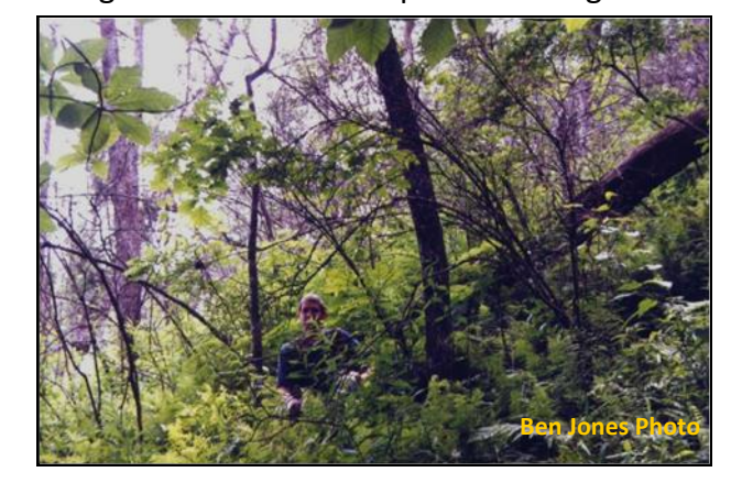
A rich herbaceous layer and midstory stems are key grouse brood habitat components.

Habitat management that enhances brood survival may have greater benefit to grouse populations than any other action. Brood habitat is an important factor in grouse