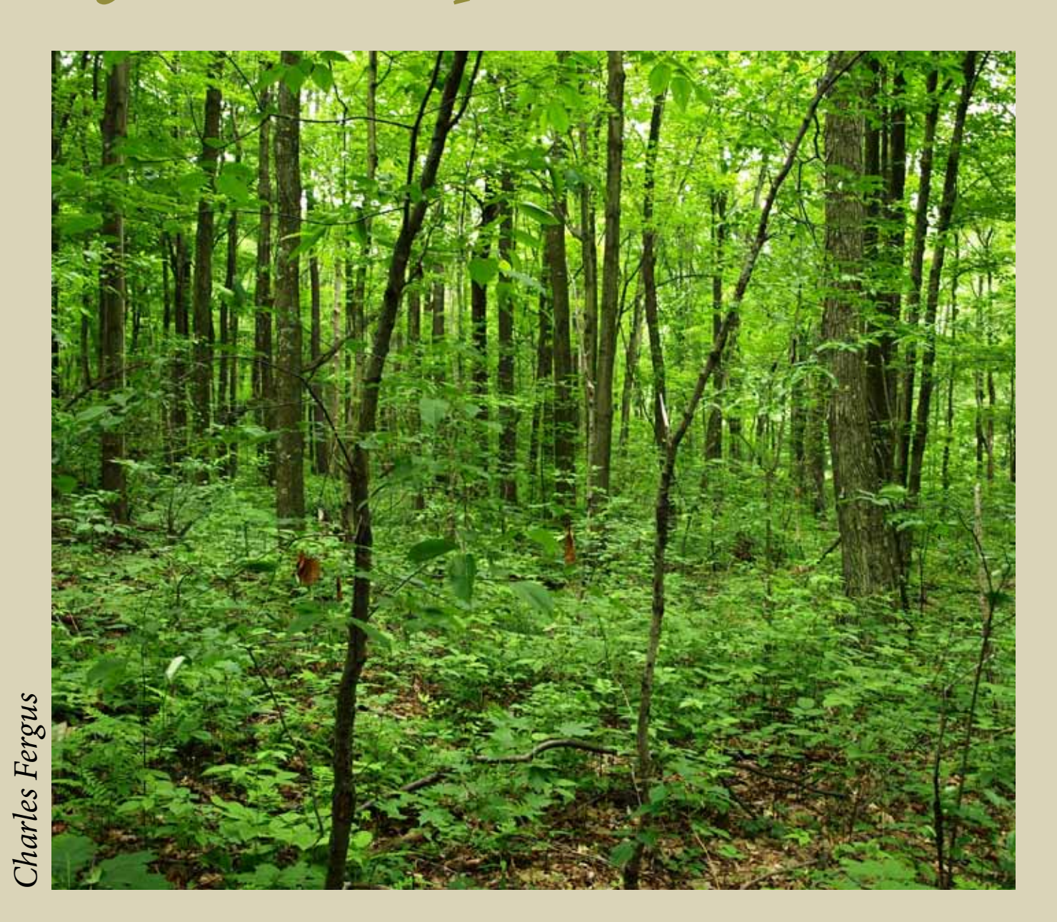
After about 20 years, the forest attracts animals that need older woods. By now, conservationists will have harvested trees elsewhere to keep some young regrowing forest a part of the natural woodland mix.