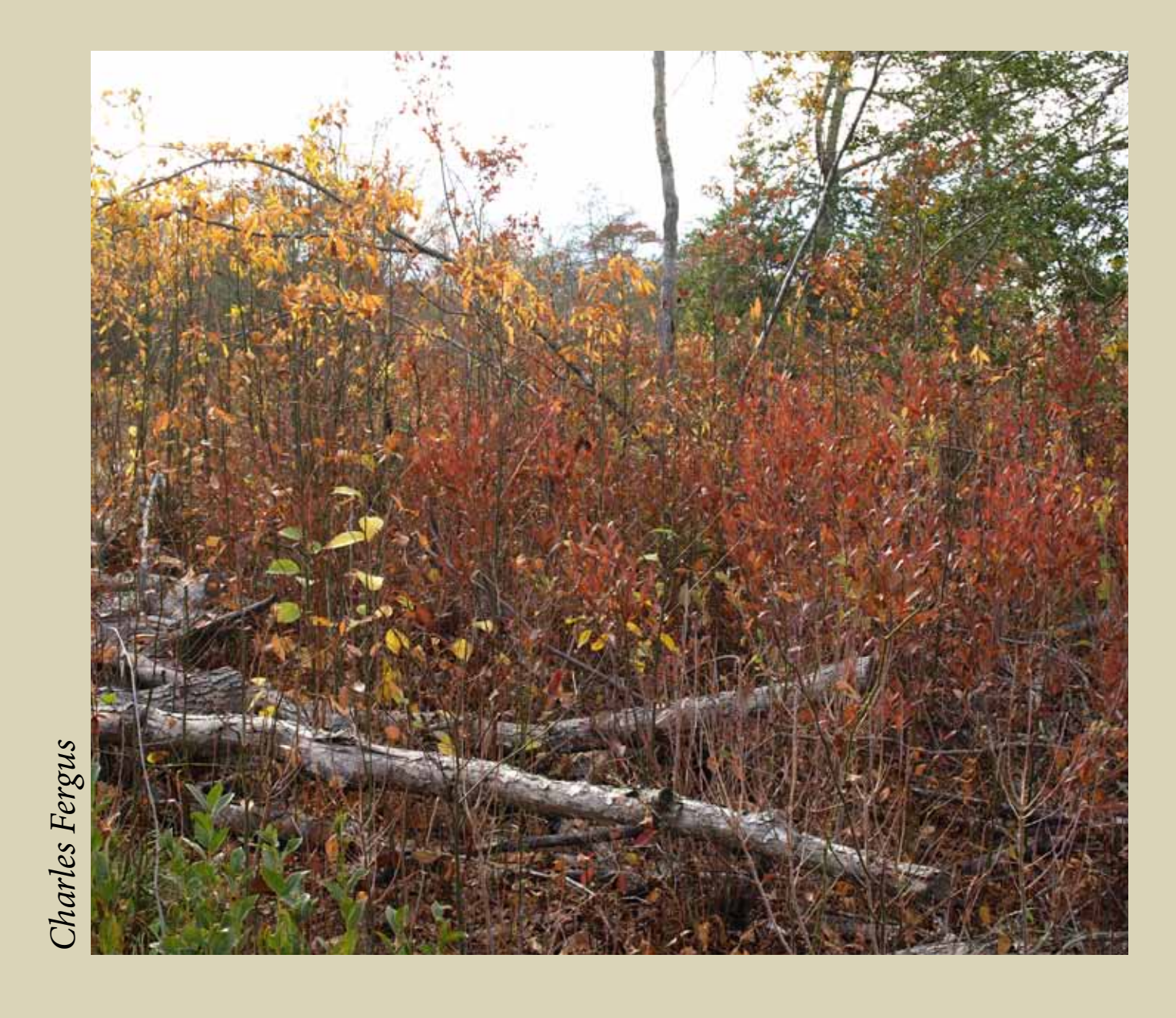
In 2 to 3 years, the young forest supports more and different types of plants mixed in among the quickly regrowing trees, offering food and shelter to a broad range of wild animals from warblers to bears.