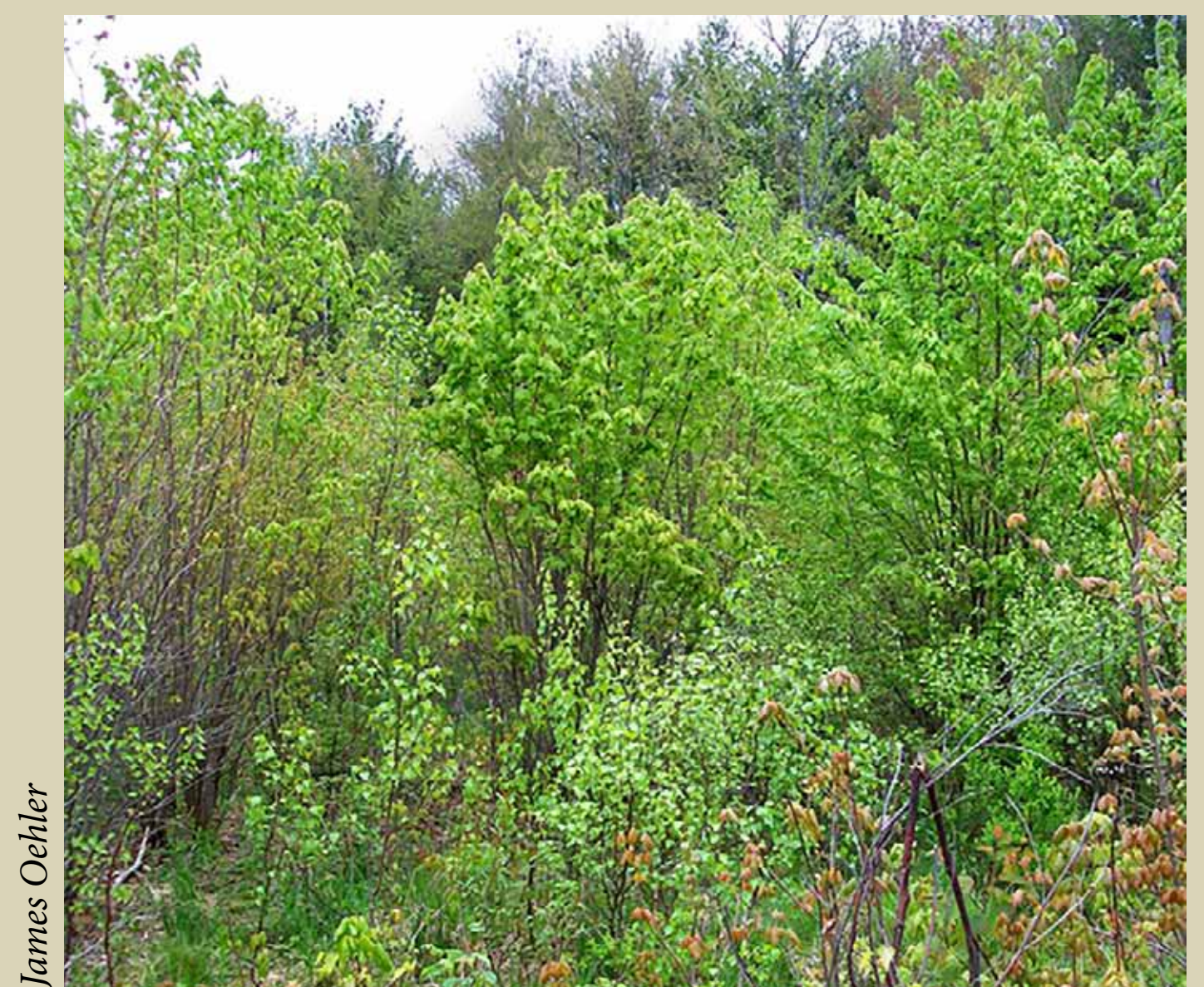
After 10 years, taller trees start shading out some of the ground plants, but the regrowing forest still provides important food and cover for bobcats, woodcock, songbirds, and a host of other creatures.