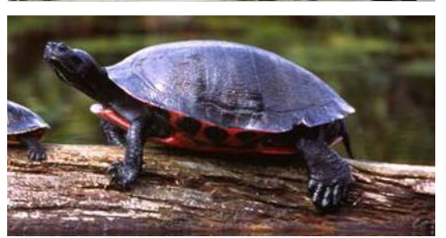
(Clockwise) New England cottontail, American woodcock, Red-bellied cooter, Prairie warbler