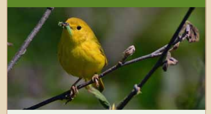
Yellow warblers nest in young forest habitat.

Become a well-informed advocate for New England's native rabbit and other young forest wildlife by visiting www.newenglandcottontail.org, www.youngforest.org, and www.timberdoodle.org.